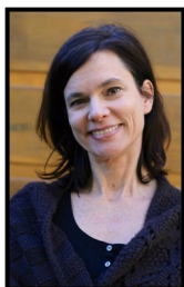
Beth Flaherty Parent Guide