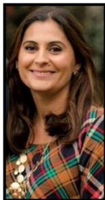
Laila Lawrence Parent Guide