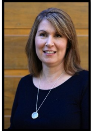
Kelly Cashion Parent Guide